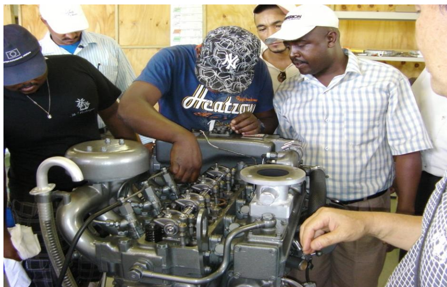
Training in maintenance of engines for enhanced safety at sea

The FAD Fishery Training Course addresses the training needs of registered fishermen willing to leave the lagoon and venture out for off lagoon fishing. It also targets fishermen interested to upgrade their fishing skills around FADs. After completing this training course the fishermen are able to safely and efficiently fish pelagic species in the open sea around FADs, using new fishing techniques. The course is of 3 weeks duration and also comprises practical sessions at sea. A certificate of attendance is awarded to the trainee who completes the training course. Each trainee is also eligible to a stipend of 300 rupees per day of attendance.