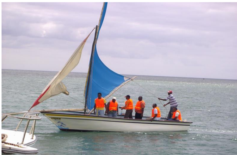
Training on the use of sails to save fuel, reduce pollution and increase safety