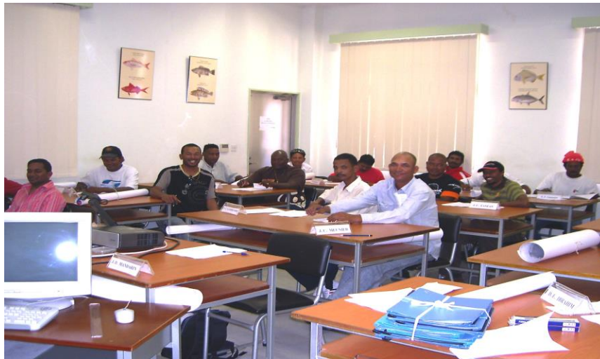
Learning the basics of fisheries is the way forward towards more professionalism

The General Course for Fisher provides fishermen with the basic knowledge and skills to start a fishing career. The training course is dispensed to non-registered fishermen who earn a living solely by fishing and who have applied for the Fisherman Registration Card. The training course is run over a period of 6 weeks, including practical sessions at sea and is free of charge.