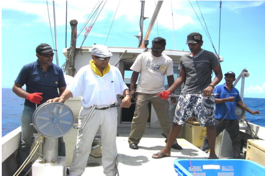
OFCF (Japan) Expert coaching trainers of FiTEC in new fishing technique

FiTEC ensures that it has a well-trained human resource to meet customer expectations by exposing its personnel with the latest technological advances in the field of fisheries. The assistance of renowned fishing agencies are sought in that respect.